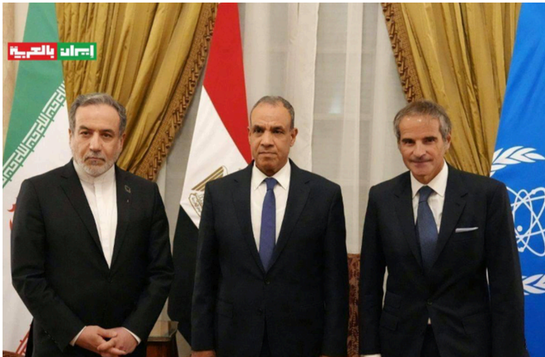
Iranian Foreign Minister Abbas Araghchi, United Nations nuclear watchdog chief Rafael Grossi and Egyptian Foreign Minister Badr Abdelatty signing new agreement.