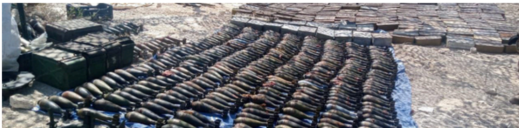
The Lebanese army began receiving arms from Palestinian refugee camps: the Beddawi camp in northern Lebanon and Ain al-Hilweh camp near the southern city of Sidon