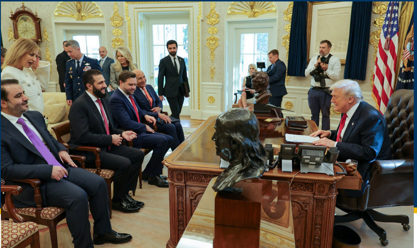
Photo Cover: President Trump's meeting with the Syrian President and his delegation

Account of the main events in the Israel-Hamas war and hostilities by the Iranian Axis