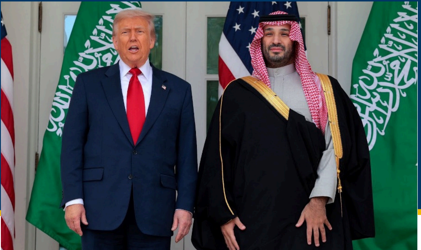
Photo Cover: President Trump's meeting with Mohammed bin Salman, Crown Prince and Prime Minister of Saudi Arabia

Account of the main events in the Israel-Hamas war and hostilities by the Iranian Axis