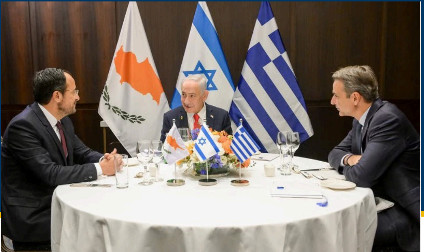
Photo Cover: Prime Minister Netanyahu meeting with Prime Minister of Greece, Kyriakos Mitsotakis, and President of Cyprus, Nikos Christodoulides as part of the Israel–Greece Cyprus summit, in Jerusalem.

Account of the main events in the Israel-Hamas war and hostilities by the Iranian Axis